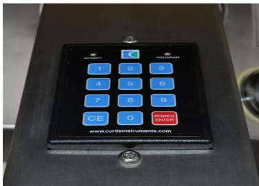
Keypad switch (9 operators)