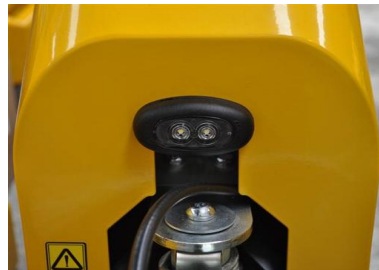
LED front lamp 24V