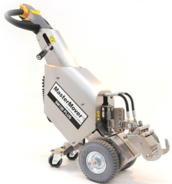
Available in stainless steel